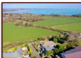
Blue Waters — The Glebe